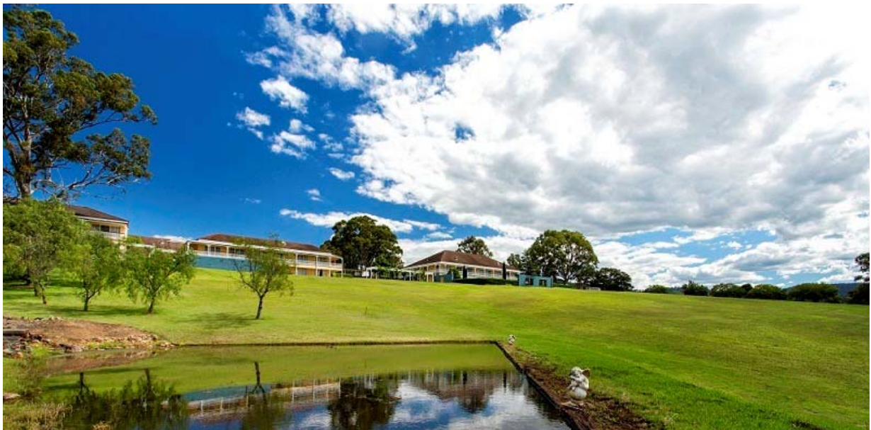
Figure 2 Full width figures between continuous section breaks. Width to match page width 16.2cm, preferably at top or bottom of page.

Your final paper should be submitted as a pdf and Microsoft Word document file (*.doc or *.docx), containing all relevant figures and tables. This will allow us to compile all the papers into a single document with consistent headers and footers.